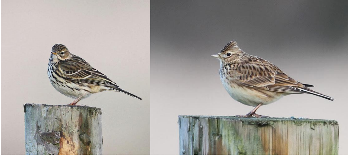
Small brown birds of open country - Meadow Pipit (left) and Skylark (right) at Wicken Fen