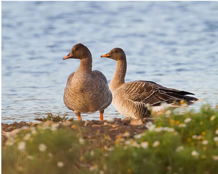
'Taiga' Bean Geese by Garth Peacock

(The records in this bulletin are unchecked and may be revised at a later date)