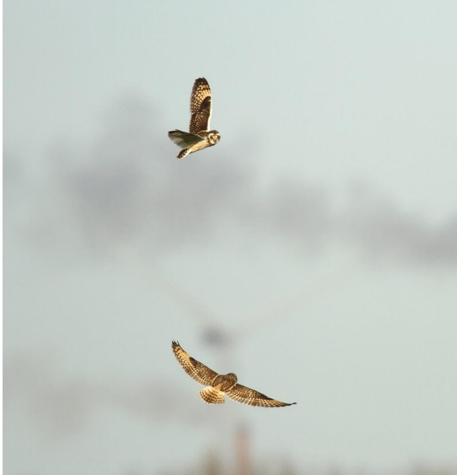
Short-eared Owls

Kingfisher reported from Cambridge Research Park, Grafham Water (2 on 17 th ), Paxton Pits, Wicken Fen.