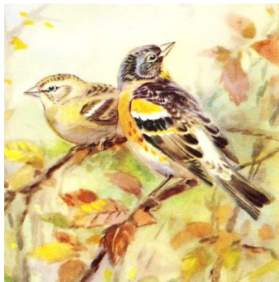
Brambling

Brambling reported from Paxton Pits and Ferry Meadows CP.