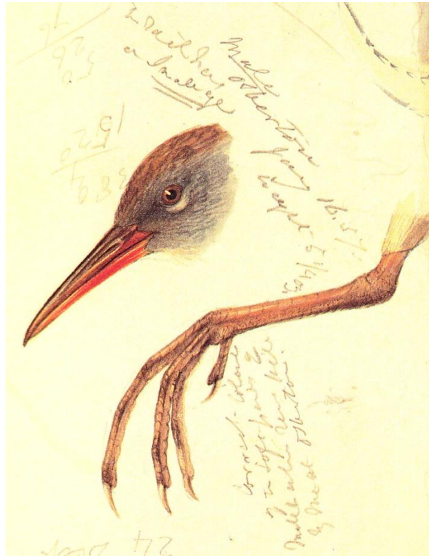
Water Rail – preliminary sketches by John Gould for his Birds of Great Britain

Water Rail reported from Cambridge Research Park, Teversham Fen, Woodwalton Fen (4 on 20 th ), Wicken Fen.