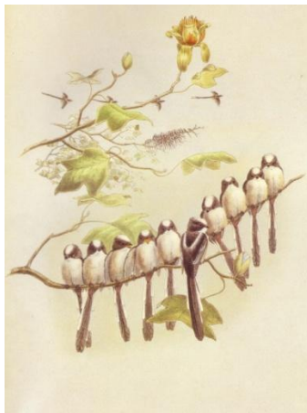
Long-tailed Tits from John Gould's Birds of Great Britain