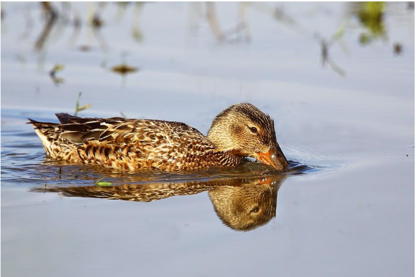
Shoveler female at Fen Drayton Lakes

Shoveler Paxton Pits (male on 13 th -17 th ), Wicken Fen (5 on 19 th ).