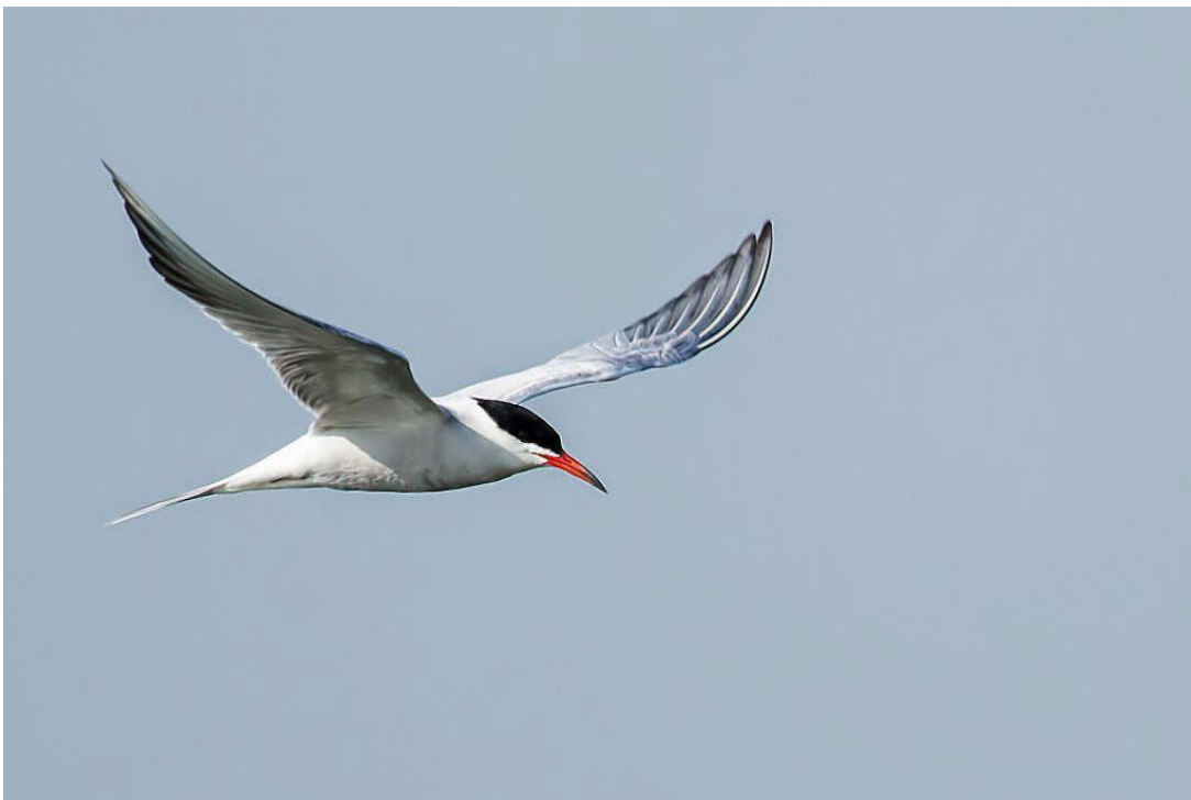
Common Tern at Fen Drayton Lakes

Common Tern Paxton Pits (c20 on 7 th ), Grafham Water (14 on 11 th ), Trumpington (4 pairs nesting on rafts).