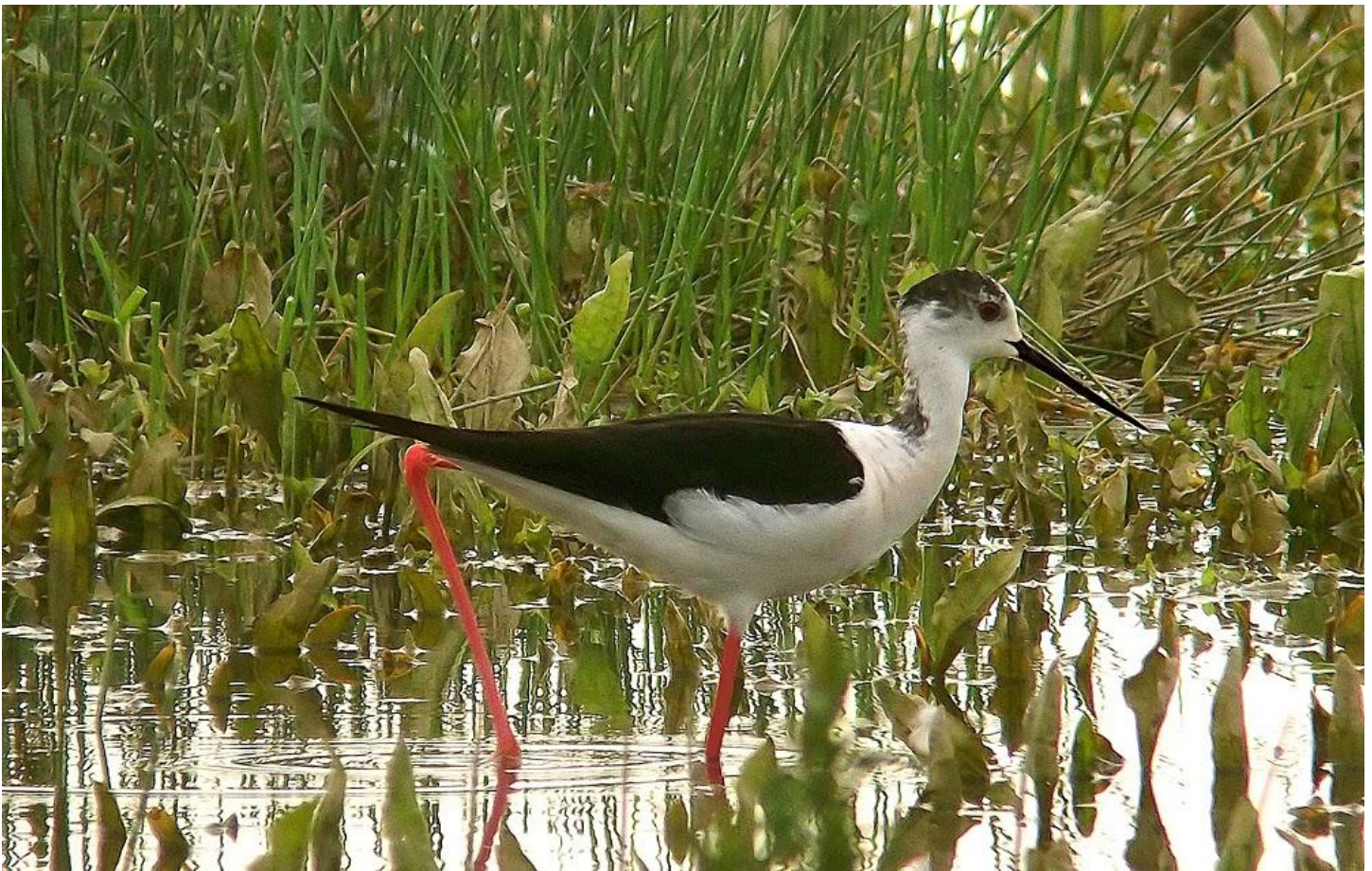
Black-winged Stilt

BLACK-THROATED DIVER* Fen Drayton Lakes (29 th ).