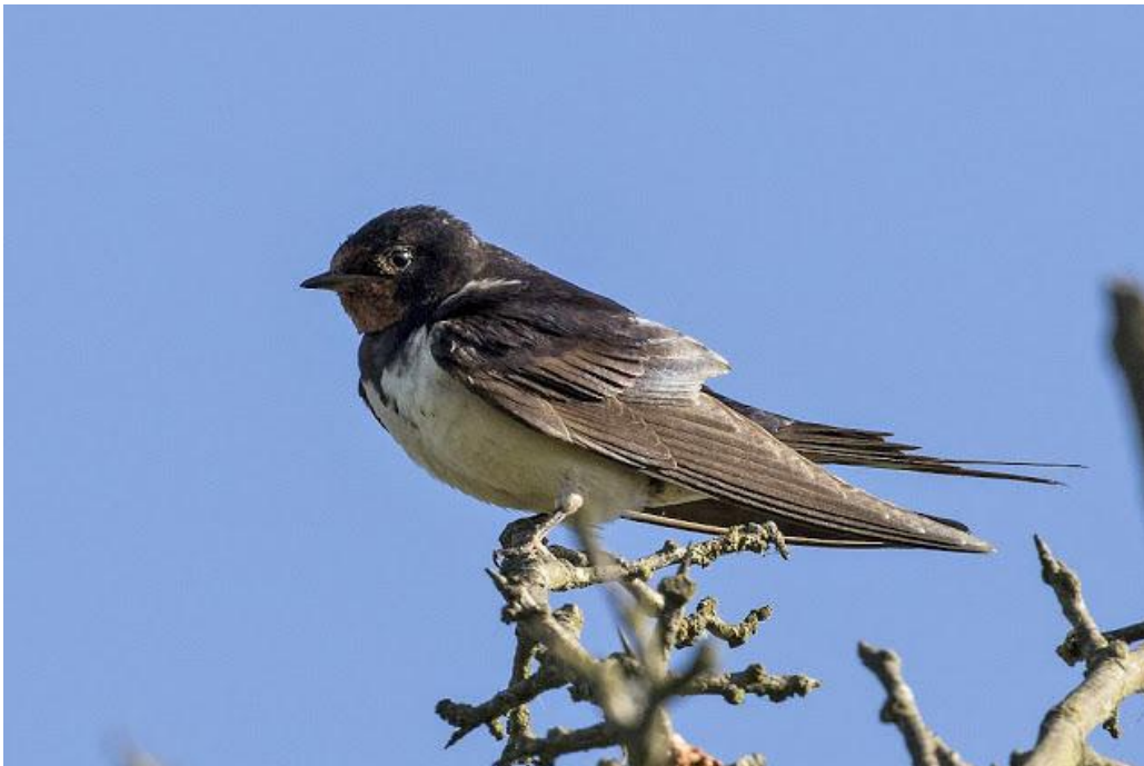
Swallow at Willingham: photo by Colin Brown

Swallow Wicken Fen/Priory Farm c120 on 14 th , Chittering an 'all white' bird on 23 rd .