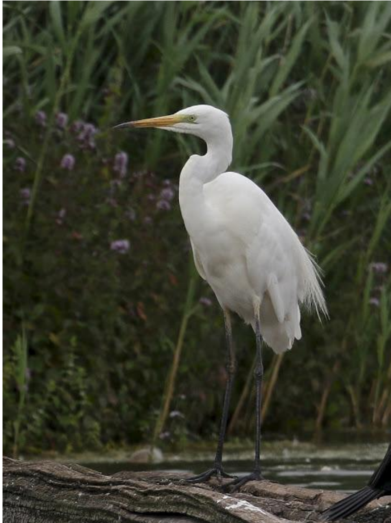
Great White Egret at Wicken Fen: photo by Roger Cresswell

(The records in this bulletin are unchecked and may be revised at a later date)