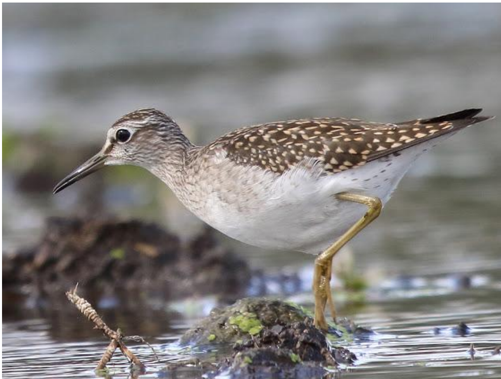
Wood Sandpiper at Burwell Fen

Snipe Grafham Water on 1 st , Ouse Fen on 2 nd , Burwell Fen on 2 nd , 12+ on 16 th , single on 19 th and c20 from 24 th , Lazy Otter 7 on 6 th a single on 11 th , Fen Drayton Lakes 4 on 10 th , a single on 11 th and 10 on 23 rd , Paxton Pits 4 on 12 th , Great Fen Rhymes Reedbed 6 on 30 th .