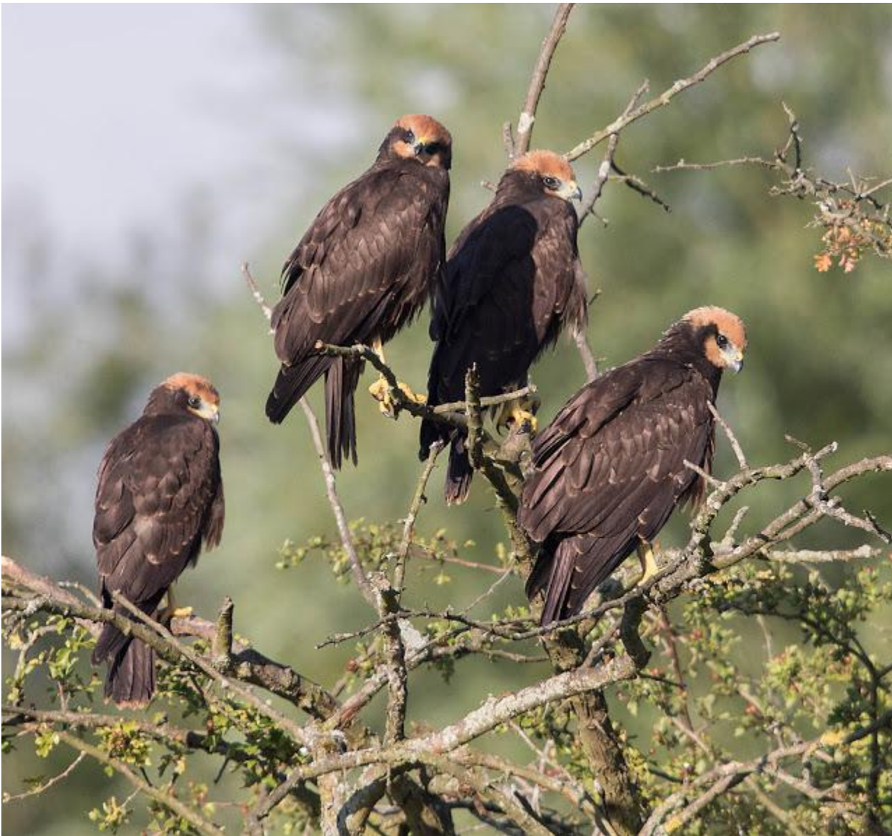
The Marsh Harrier brood at Fowlmere NR: photo by Gary Thornton