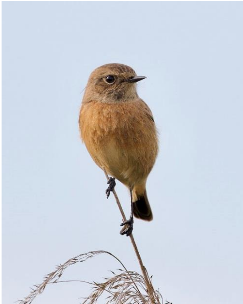
Stonechat at Wicken Fen

Wheatear Witchford on the 1 st , Littleport May Farm 3 on the 6 th and 2 on the 26 th (latest date so far reported), Paxton Pits on the 14 th - 15 th , Littleport-Queen Adelaide on the 19 th .