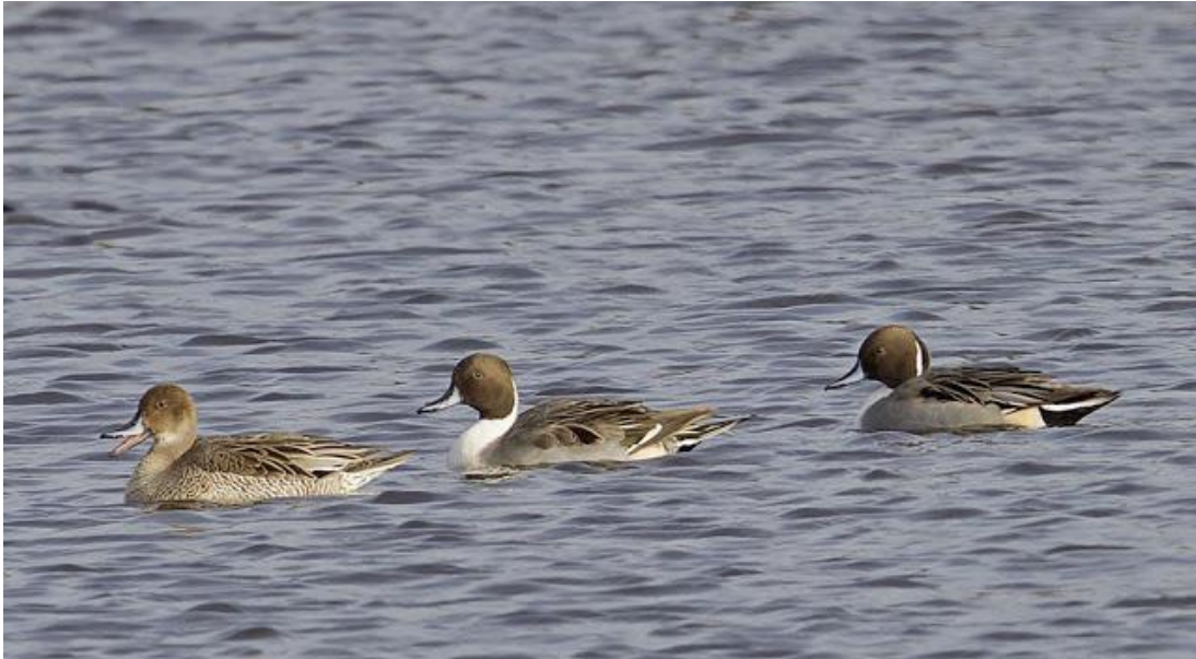
Pintail at Wicken Fen: photo by Roger Cresswell.

Pintail Wicken Fen 3 on the 19 th , Grafham Water on the 21 st , Kingfishers Bridge a female on the 29 th .