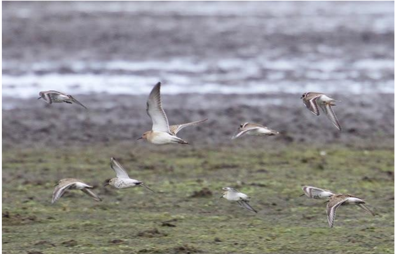
A flight of waders at Burwell Fen - a good ID test!

(The records in this bulletin are unchecked and may be revised at a later date)