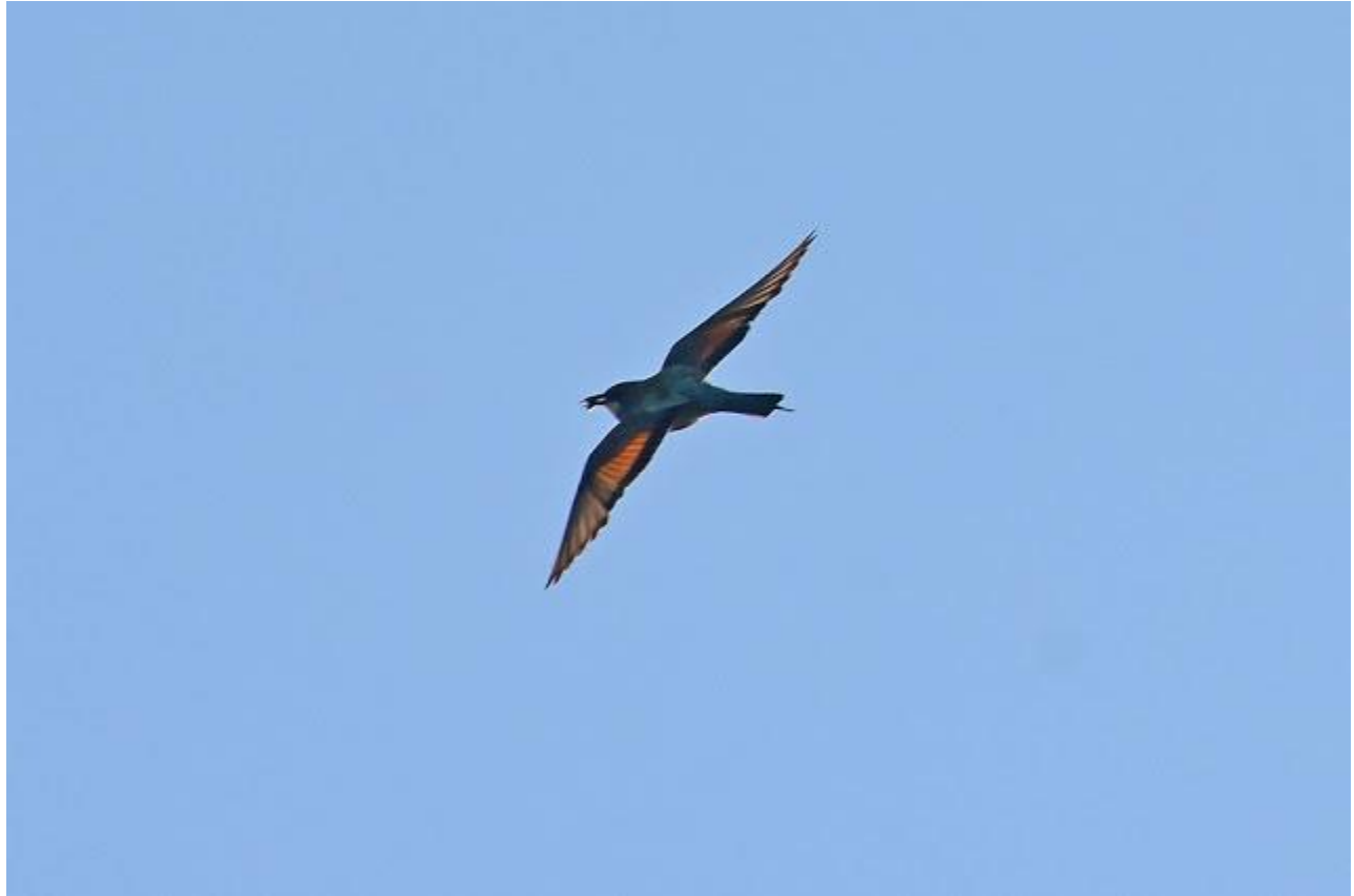
Bee-eater at Stanground Gullet: photo by George Walthew.

BEE-EATER* Stanground Gullet on the 27 th .