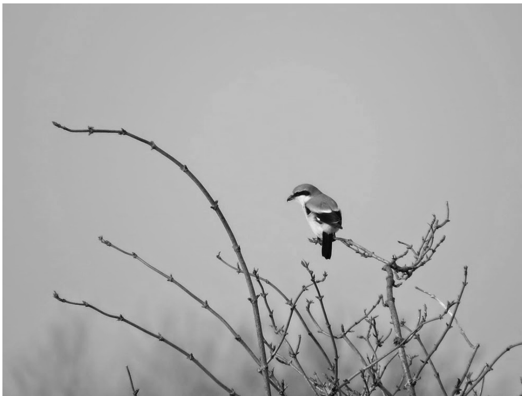
Great Grey Shrike at Swaffham Prior Fen.