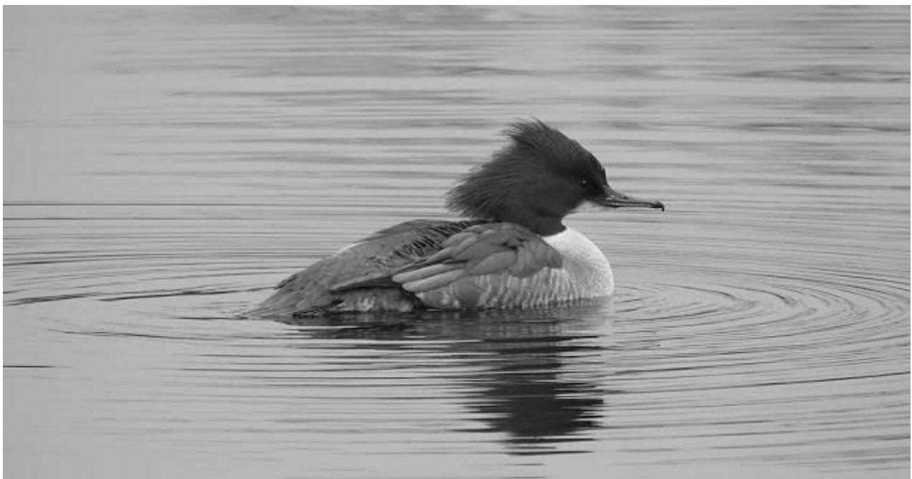
Goosander at Paxton Pits