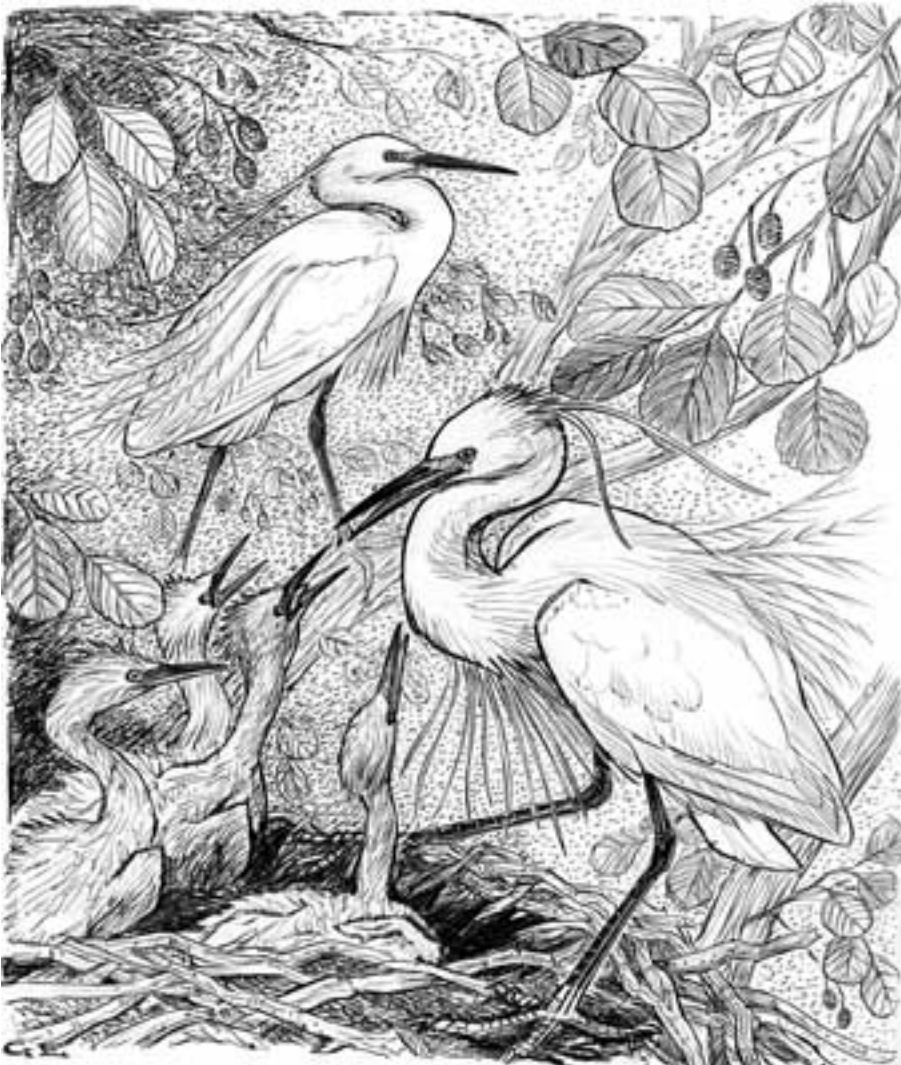
Little Egrets

Please submit any outstanding records to the County Recorders (including descriptions) by May 7th.