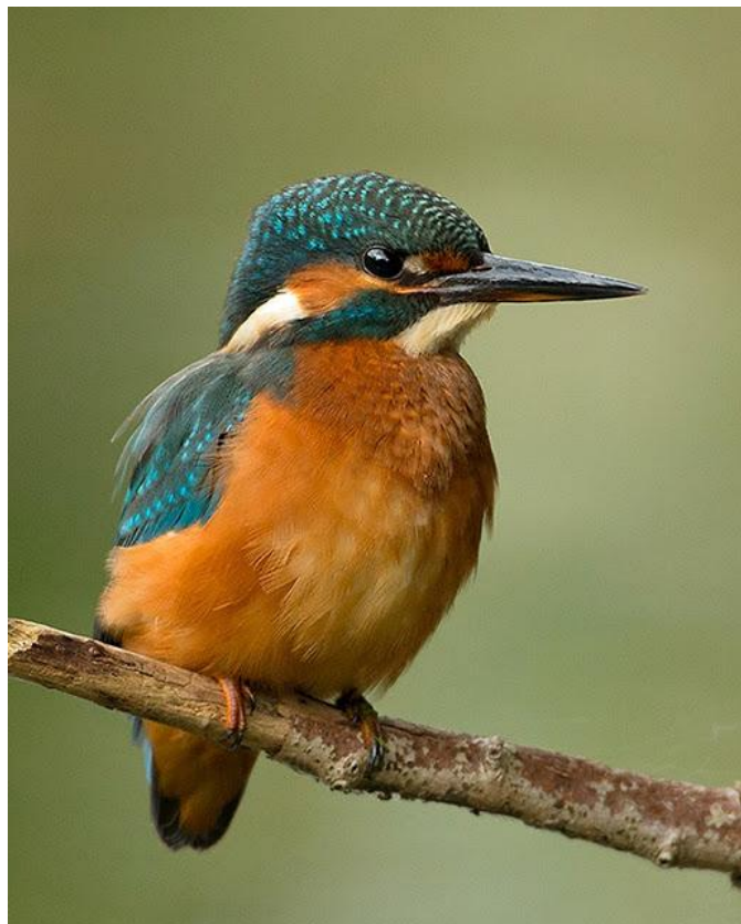
Kingfisher

Raven One at Abbotsley (Crane Hill) (29 th ).