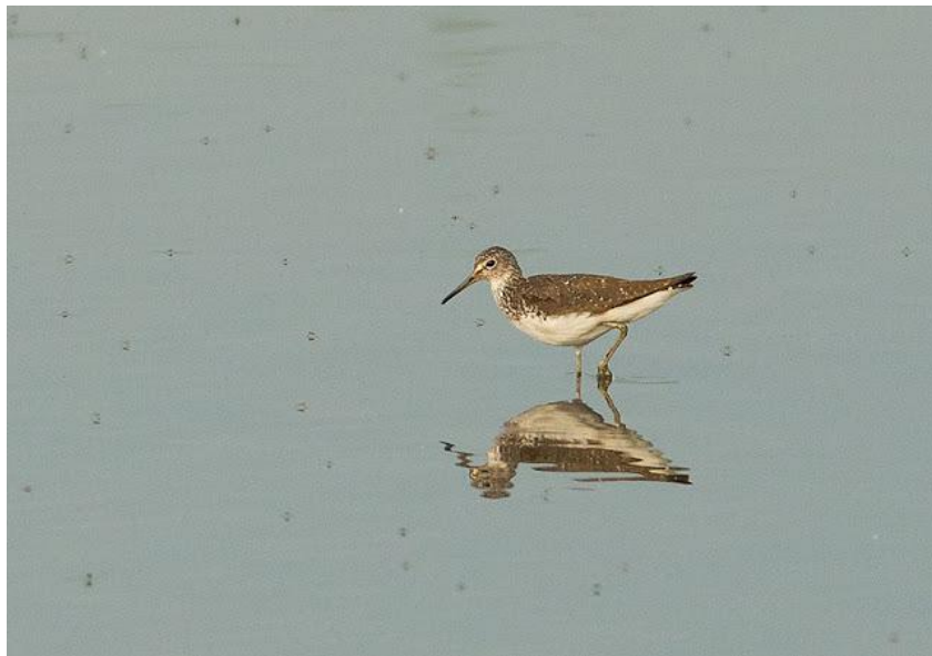
Green Sandpiper

Green Sandpiper Cam Washes (2 on 9 th ), Ferry Meadows (12 th ), Ouse Washes RSPB (maximum 4 on 20 th – 28 th ), Paxton Pits (maximum 2 on 21 st ), Cambridge Research Park (21 st ), Fen Drayton Lakes (maximum 5 on 23 rd ), Grafham Water (maximum 8 on 24 th ), Maxey Pits (maximum 6 on 23 rd and 28 th ), Burwell Fen (maximum 3 on 22 nd and 28 th ).