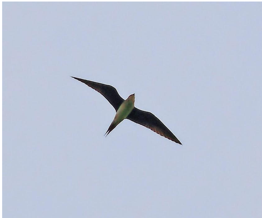
Black-winged Pratincole on the Ouse Washes

* GREAT WHITE EGRET Ouse Washes (2 nd – 6 th ), Wicken Fen (9 th , 16 th and 22 nd ), March Farmers (11 th ), Burwell Fen (15 th and 25 th ).