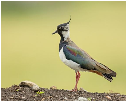
Lapwing at Pymore.

Lapwing Ouse Washes RSPB, Paxton Pits (50 on 5 th , 72 on 7 th , 206 on 8 th , c350 on 20 th , 500+ on 27 th ), Burwell Fen (80+ on 14 th , 321 on 22 nd and 150 on 25 th ).