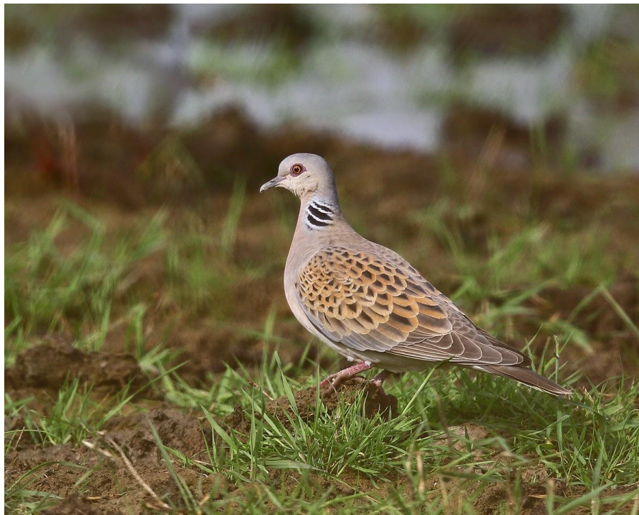
Turtle Dove photograph by Garth Peacock.

Turtle Dove reported from: Chrishall, Fowlmere NR (maximum 4 birds), Heydon, Little Staughton (2), March, Ouse Washes (4 on 3 rd ).